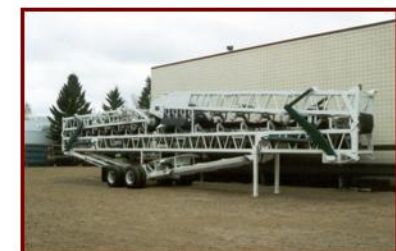
Clemro stackers are compact and never a problem to transport.