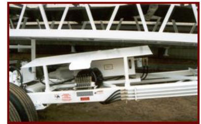
Shielding protects the hydraulic components from falling debris.