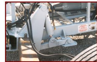
Hydraulic jack legs allow quick set-up.