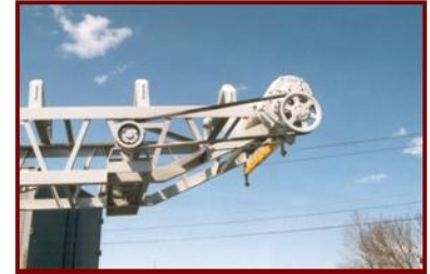
Clemro manufactured conveyor